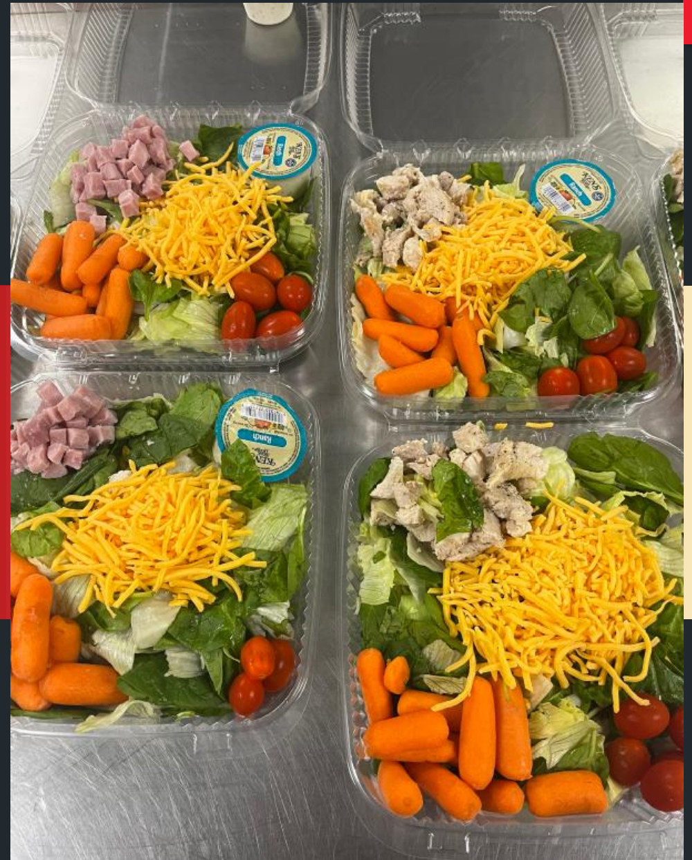
Whitewright ISD– Walnut Creek Farms