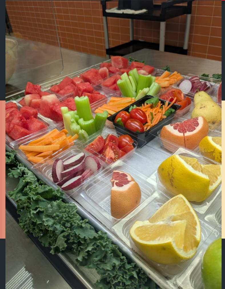
Lake Travis ISD-Carrots via Troisi Farms